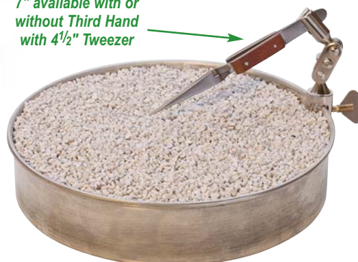
SOL-525.00 (7") with Third Hand

7" available with or without Third Hand with 4 1/2" Tweezer