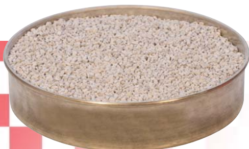
SOL-520.00 (7") without Third Hand

Pans rotate 360° for easy access to your work!